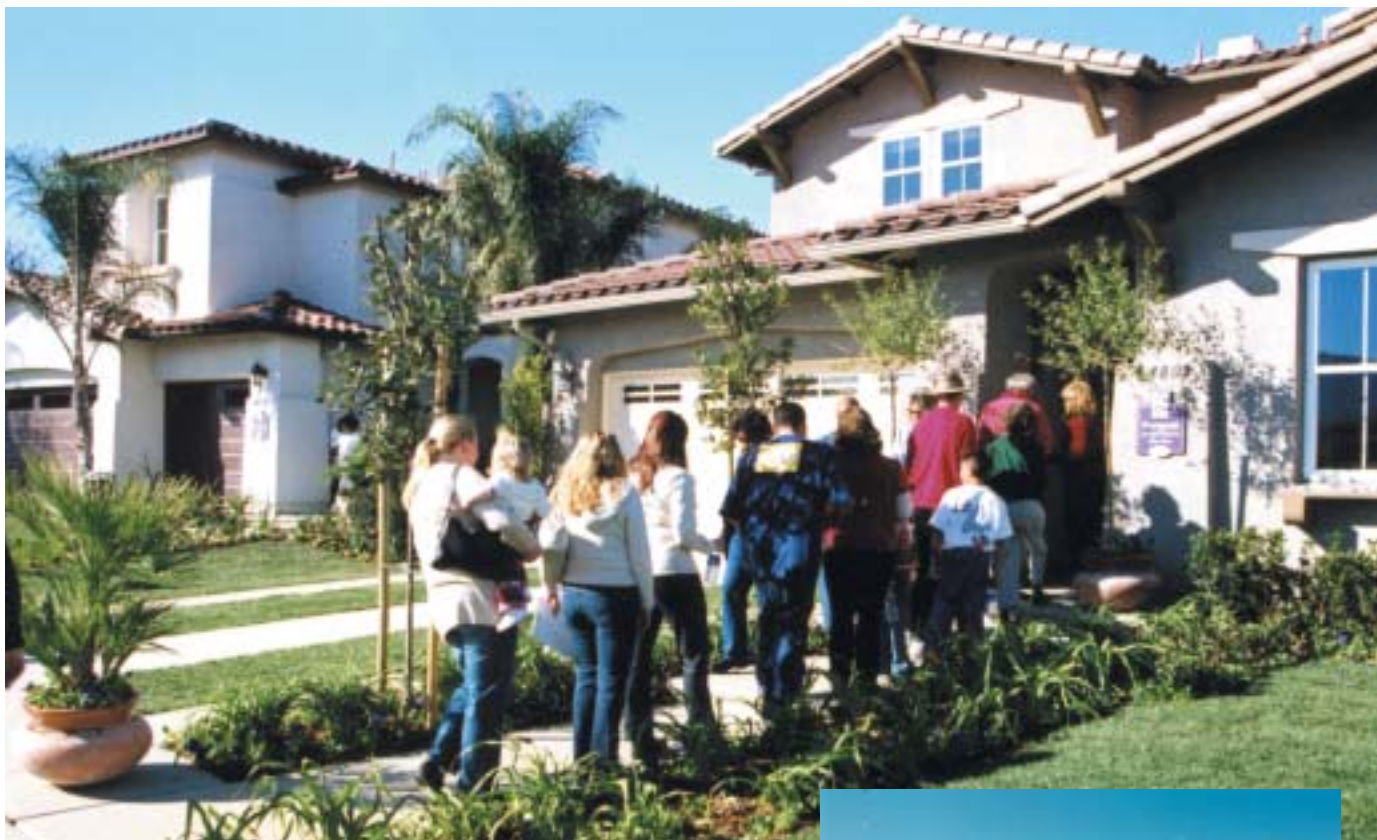
Hundreds of potential homebuyers lined up to view the three new neighborhoods at Morgan Hill's grand opening. The festive atmosphere was complemented by a beautiful sunny winter day in the Temecula Valley.

Model homes are now open at three neighborhoods within Morgan Hill, The Corky McMillin Companies' newest master-planned community in the Temecula Valley.