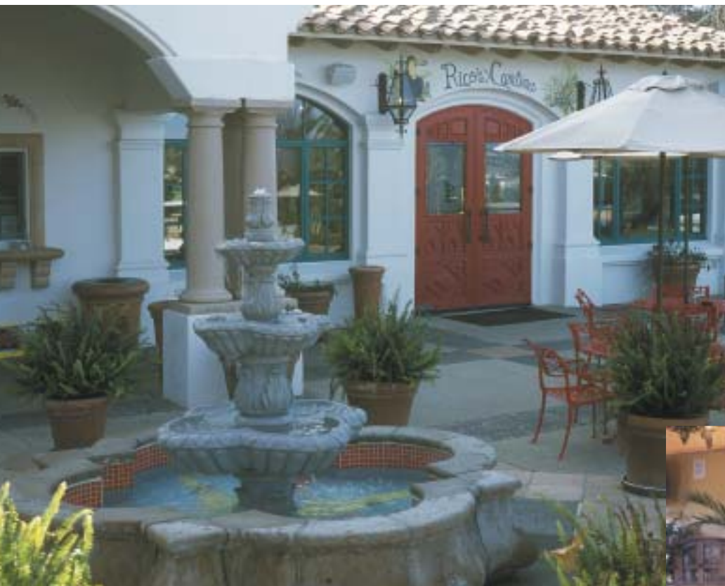
Rico's Cantina features welcoming Southwestern décor with hand-painted murals and a fireplace inside and an open outdoor patio with a fountain and breathtaking views of the Redhawk golf course and mountains beyond.

For more information on the Redhawk Golf Course, visit www.redhawkgolfcourse.com or phone 1-909-302-3850.