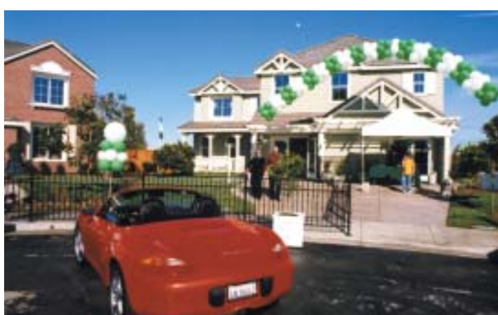
Olde Orchard, shown above during its grand opening, has experienced tremendous success, with all 44 homes released to date now sold.

Olde Orchard by K. Hovnanian will comprise an eventual 100 single-family homes in four plans, showcasing Spanish, farm house and colonial styles. With 3,128 to 4,209 square feet of living space, Olde Orchard homes